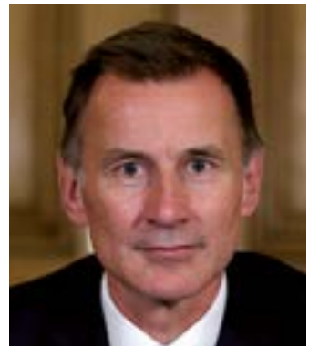
Official portrait of Jeremy Hunt MP

Nevertheless, the OBR says that Mr Hunt will meet his fiscal rule of debt falling as a proportion of gross domestic product (GDP) in 2028/29, by which time total borrowing will exceed £3,000 billion. The margin by which the Chancellor meets the rule is just £9 billion, which the OBR notes is "a tiny fraction of the risks around any forecast".