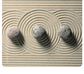
SELF-INVESTED PERSONAL PENSIONS (SIPPS)

The investment option that lets you control how and where your money is invested