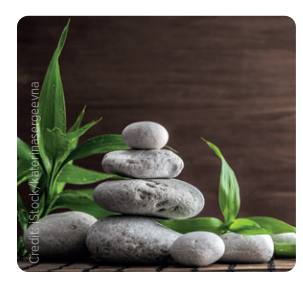
THE POWER OF YOUR PENSION

The investment option that lets you control how and where your money is invested