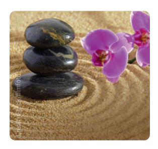
THE TAX BURDEN ON HIGH INCOME